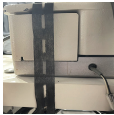
Leftover interlining Retrieving