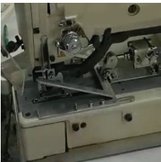
Positioning Guide Design