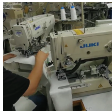
Tandem Machine Operation