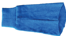
Finished Sleeve after Attaching Rib Cuff

For attaching rib cuffs on knit shirts and pants. Reducing sewing operators' skill dependency through digitally controlled operations..