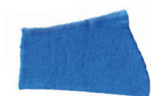
Sleeve Before Attaching