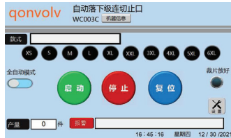
Sizes Switching through Touch Screen Panel